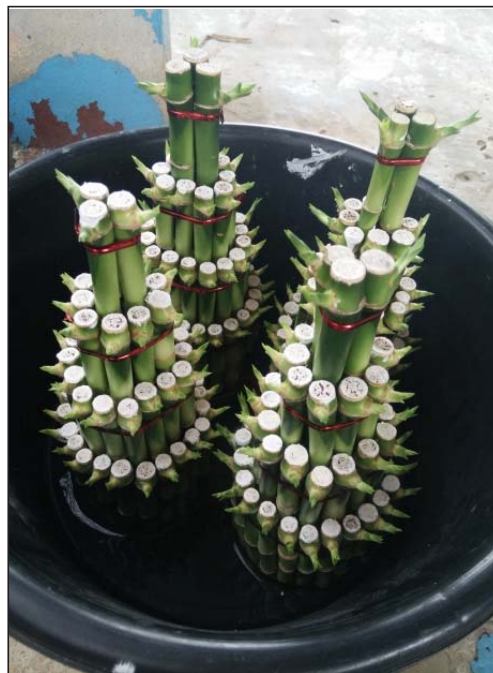
Figure 2. Budding lucky bamboo traded in the domestic market.

The lucky bamboo was processed by cutting it into small pieces, which were cultivated in water until they sprouted roots and shoots. This type of bamboo is called “Budding lucky bamboo.” The production process of this type of bamboo was matched with the needs of customers and with the mosquito breeding environment concept of public health officials.