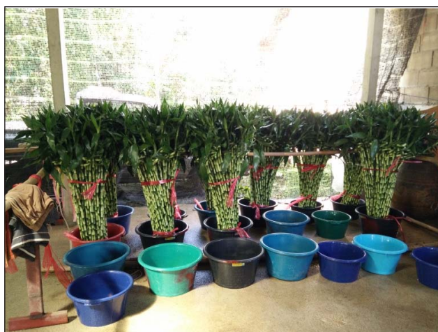
Figure 1. Spiral lucky bamboo exported to international markets.

In 1984, the ability of this village to produce agriculture started to change because new crops arrived at the village. An orchid investor loaned the villagers US$6,000 per family to produce lucky bamboo, which was in high demand in the international markets. The import of new crops released the villagers from debt within a year, and they became wealthier. A 45-year old lucky bamboo farmer remarked that “Canada transferred US$600,000 each time. If we did not have deals with Canada that day, we would not be in this situation today.” [my translation from Thai].